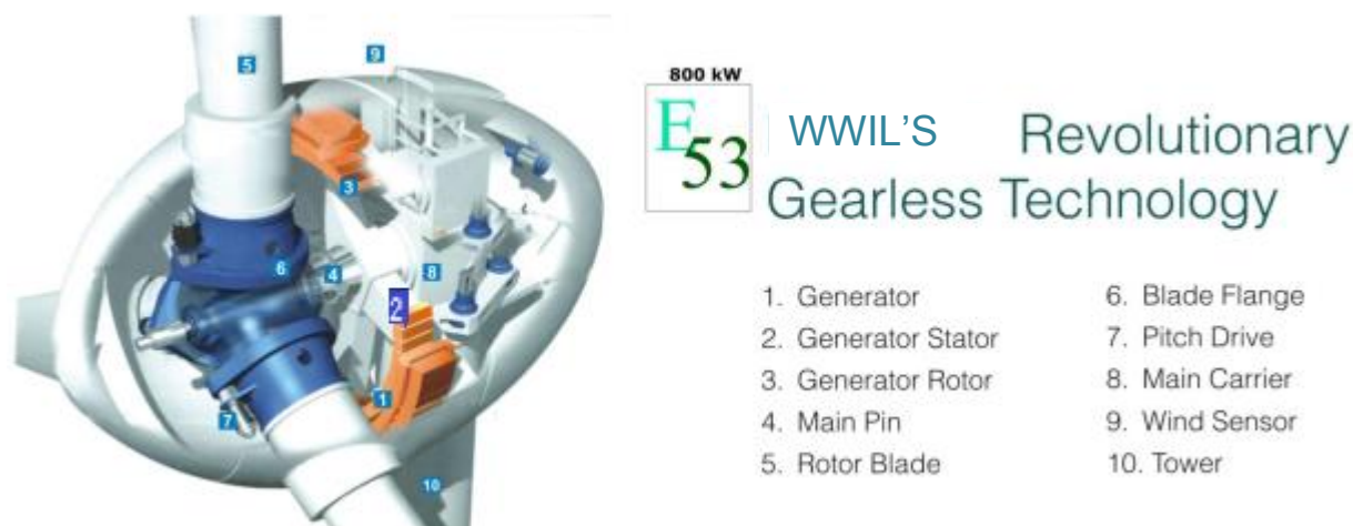
Figure: Wind World make E-53 Diagram.