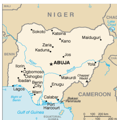
Figure 3: Map of Nigeria

The CPAs have been implemented within the boundary of the Republic of Nigeria as depicted in Figure 4 below