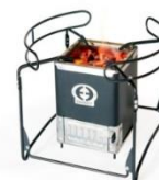
Figure 5: Econochar /SmartSaver Charcoal