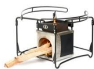
Figure 1: Econofire /SmartSaver Wood

The stove models referred above are shown below: