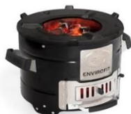
Figure 3: CH5300 - Charcoal