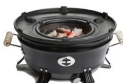
Figure 4: CH5200 - Charcoal