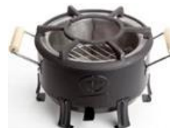
Figure 2: M5000 /SuperSaver Wood