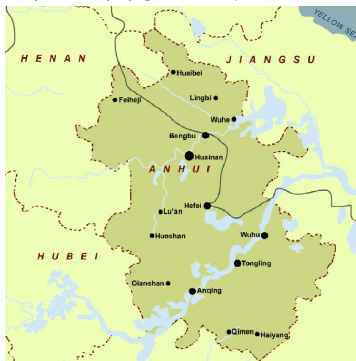
Figure 2. The geographical boundary of Anhui Province