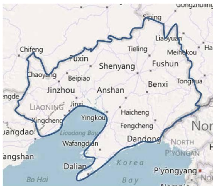
Figure 1. The geographical boundary of the SSC-PoA