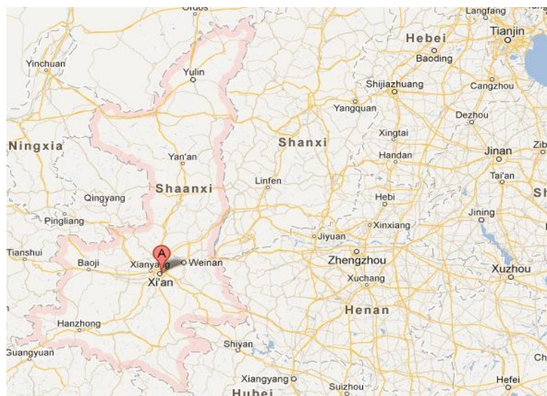
Figure 1. The geographical boundary of the SSC-PoA