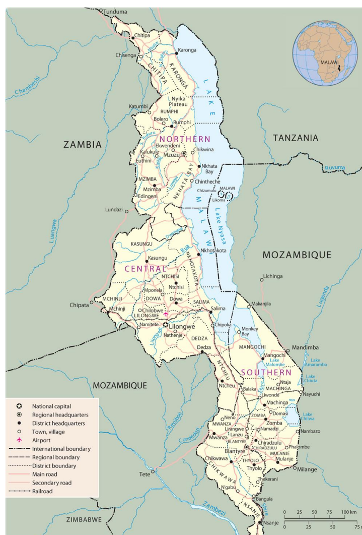
Pic. 1. Map of Malawi

All specific-case CPAs (i.e. CPA 10182-P1-0001-CP1, CPA 10182-P1-0002-CP1, CPA 10182-P1-0003-CP1, CPA 10182-P1-0004-CP1, CPA 10182-P1-0005-CP1, CPA 10182-P1-0006-CP1, CPA 10182-P1-0025-CP1, CPA 10182-P1-0020-CP1, CPA 10182-P1-0021-CP1, CPA 10182-P1-0022-CP1, CPA 10182-P1-0023-CP1, CPA 10182-P1-0024-CP1, CPA 10182-P1-0007-CP1, CPA 10182-P1-0009-CP1, CPA 10182-P1-0008-CP1, CPA 10182-P1-0010-CP1, CPA 10182-P1-0011-CP1, CPA 10182-P1-0012-CP1, CPA 10182-P1-0013-CP1, CPA 10182-P1-0014-CP1, CPA 10182-P1-0015-CP1, CPA 10182-P1-0016-CP1, CPA 10182-P1-0017-CP1, CPA 10182-P1-0018-CP1, CPA 10182-P1-0019-CP1, CPA 10182-P1-0032-CP1) are CPAs promoting ICSs in Malawi (Host Party).