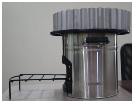
Figure 2 ICS S32-13