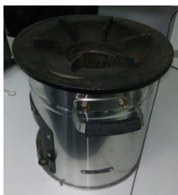
Figure 1 ICS S26-13