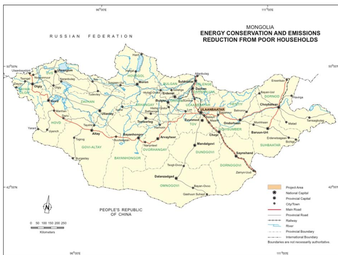
Figure 1: National Map of Mongolia

The host party of the project activity is Mongolia.