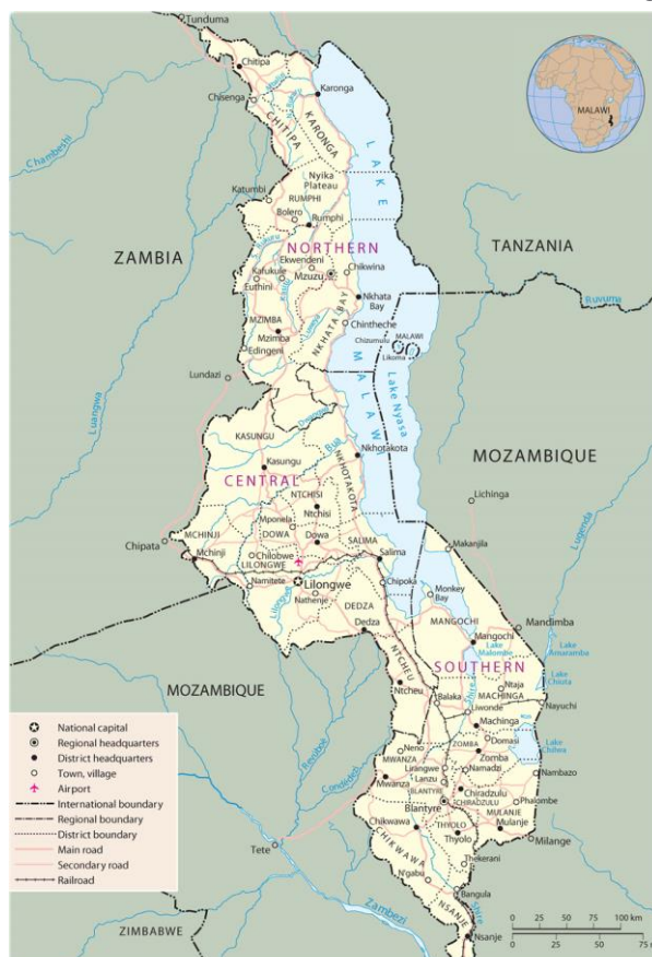
Pic. 1. Map of Malawi