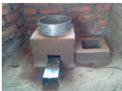
Figure 1 below shows the TLC Rocket Stove: