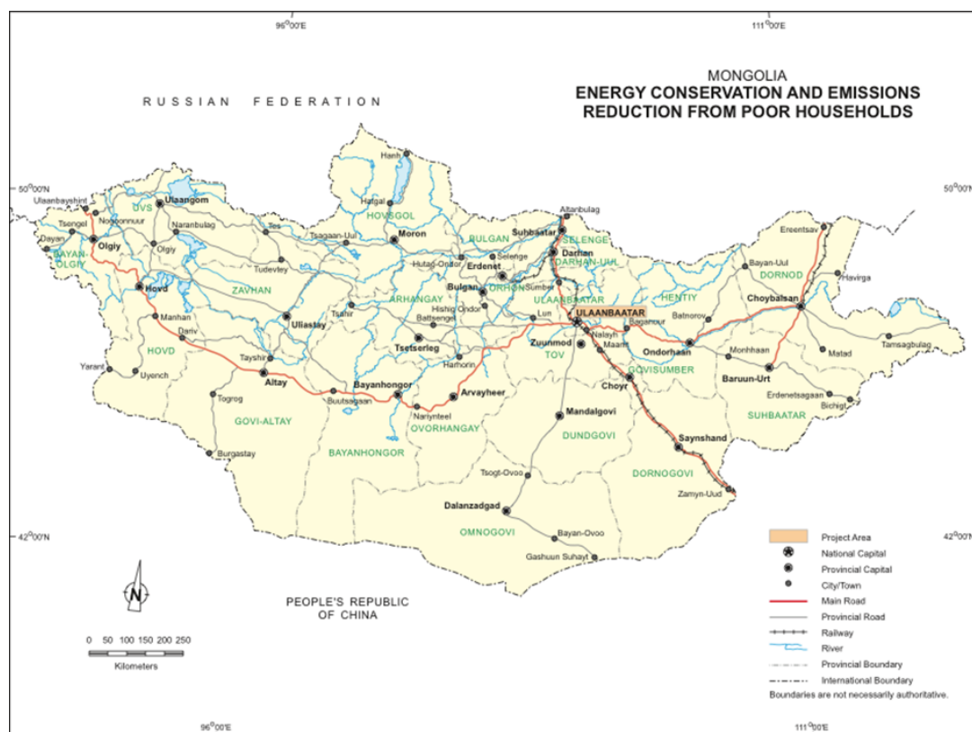
Figure 1: National Map of Mongolia

The host party of the project activity is Mongolia.