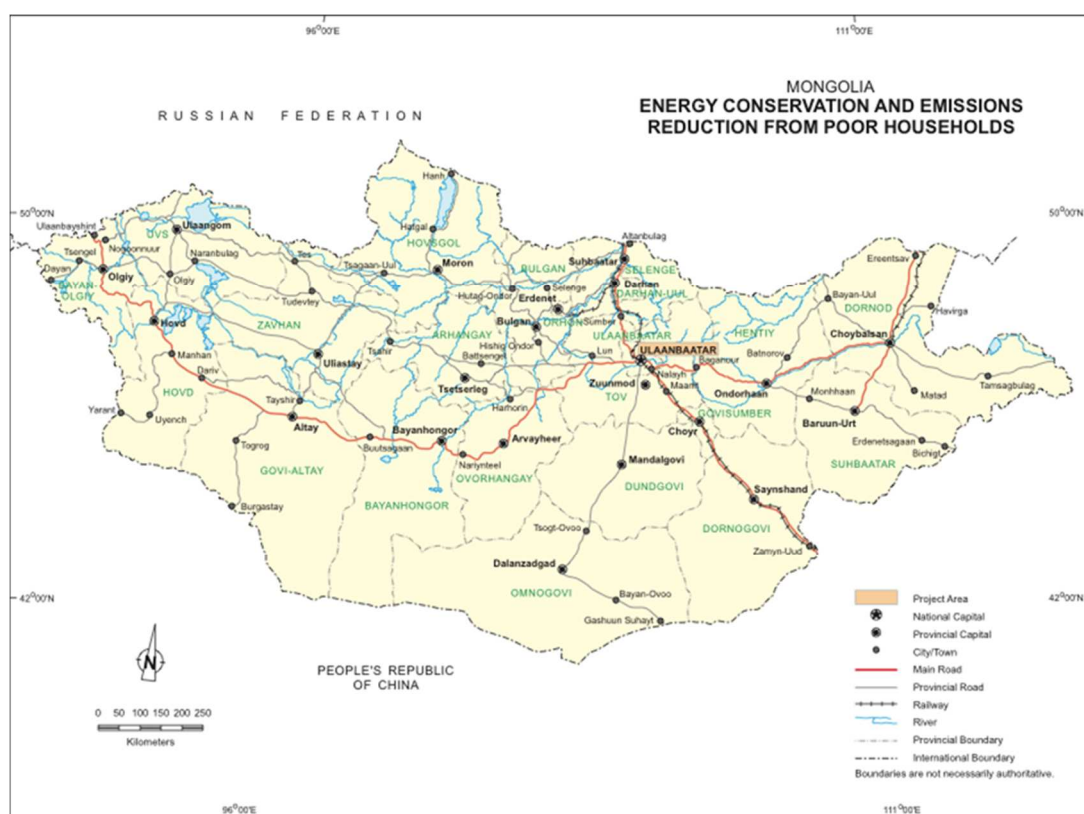
Figure 1: National Map of Mongolia

The host party of the project activity is Mongolia.