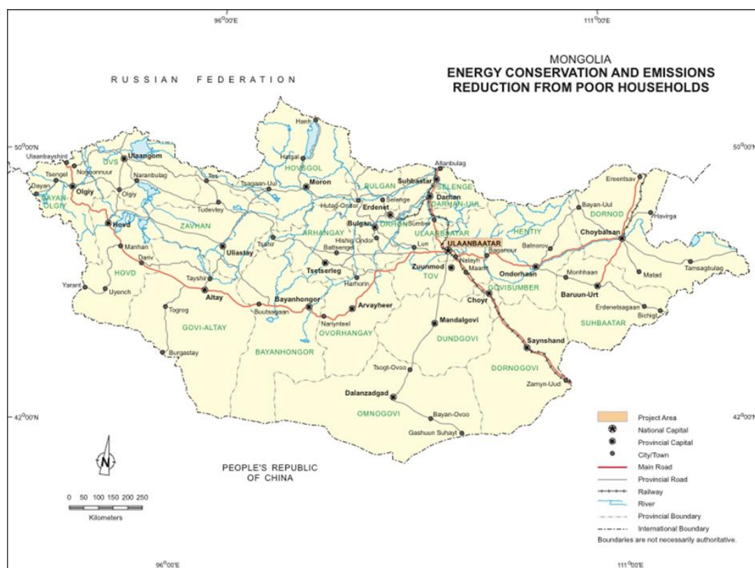
Figure 1: National Map of Mongolia

The host party of the project activity is Mongolia.