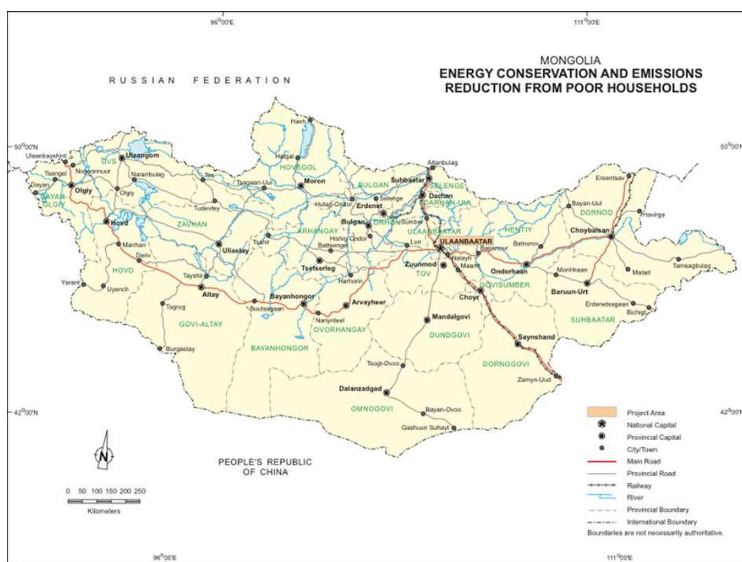
Figure 1: National Map of Mongolia

The host party of the project activity is Mongolia.