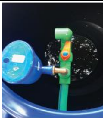
Picture 2: UltraFlo Installation