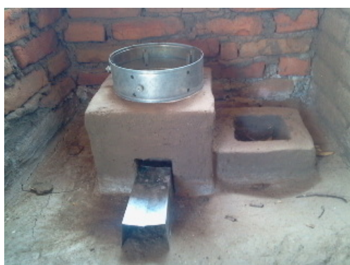
Figure 1 below shows the TLC Rocket Stove: