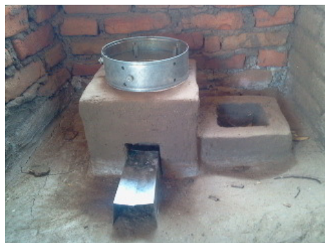
Figure 1 below shows the TLC Rocket Stove: