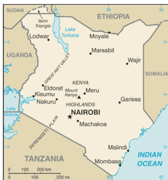
Figure 1: Map of the Republic of Kenya

All of the biogas systems implemented under this CPA detail unique GPS coordinates that are recorded in the CME's database. These enable the DOE to identify systems listed in the database and verify their location within the boundaries of the Republic of Kenya. The database further includes information regarding the owner and the digesters operational status.