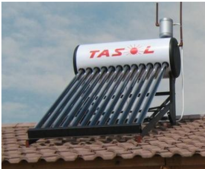
Figure 1. Low pressure vacuum tube collector SWH system

Worldwide SWH technology is well-established in terms of technological development. Standard specifications have been available since 1980, to support the wider adoption of the technology. In countries where SWH systems have been installed, they have been shown to have effective operating lifetimes in excess of ten years. There is a small local, South African, production capacity which serves the small existing market mainly in high income household. By the end of 2009 less than 5 000 SWH has been installed in South Africa under the Eskom programme 4 . This capacity can be scaled up significantly to supply a bigger market.