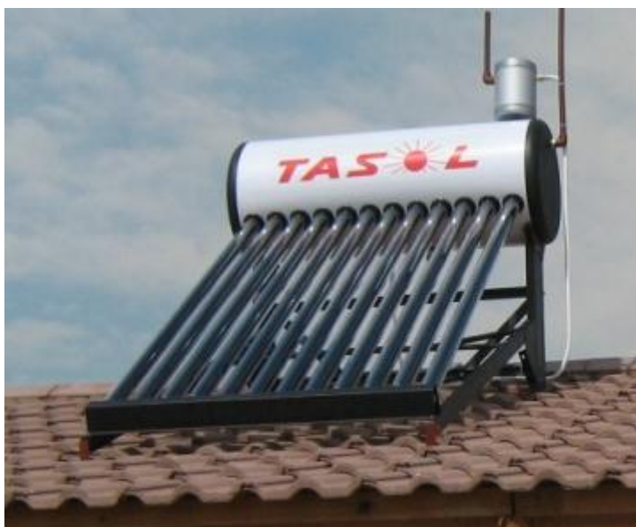
Figure 1. Low pressure vacuum tube collector SWH system

Worldwide SWH technology is well-established in terms of technological development. Standard specifications have been available since 1980, to support the wider adoption of the technology. In countries where SWH systems have been installed, they have been shown to have effective operating lifetimes in excess of ten years. There is a small local, South African, production capacity which serves the small existing market mainly in high income household. By the end of 2009 less than 5 000 SWH has been installed in South Africa under the Eskom programme 4 . This capacity can be scaled up significantly to supply a bigger market.