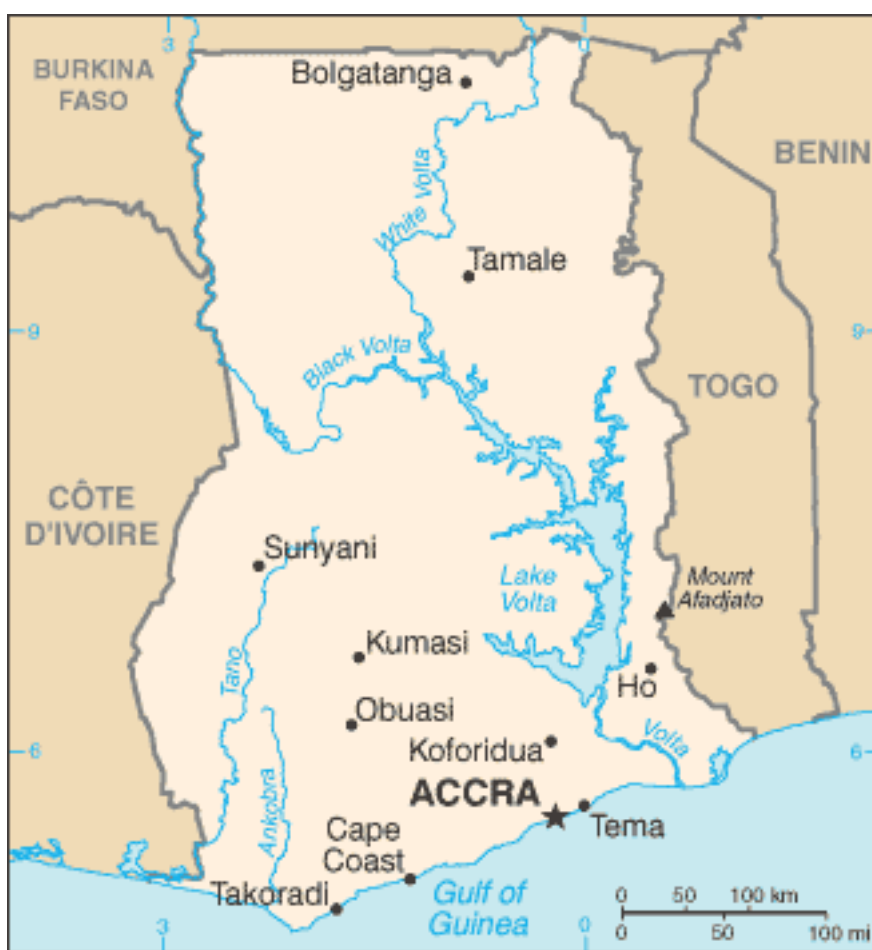
Map of the Republic of Ghana

Physical Geographical location: The geographical location of Ghana is depicted by the map below.