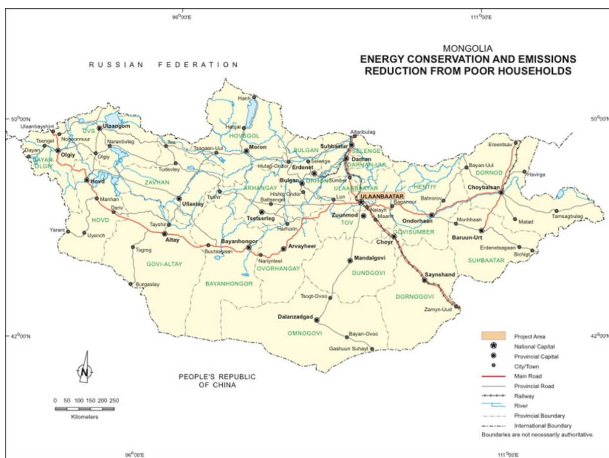
Figure 1: National Map of Mongolia

>> The host party of the project activity is Mongolia.