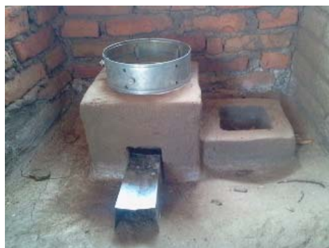
Figure 1 below shows the TLC Rocket Stove: