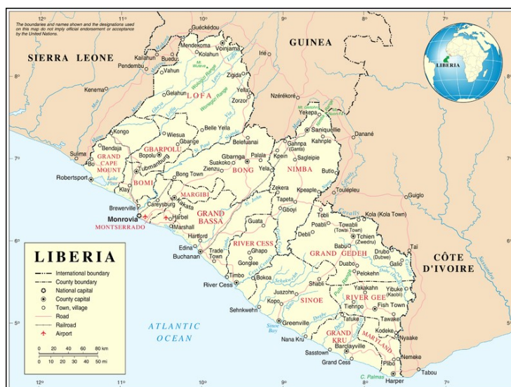
Figure: Map of Liberia

Physical Geographical location: The geographical locations of Liberia is depicted by the map below.