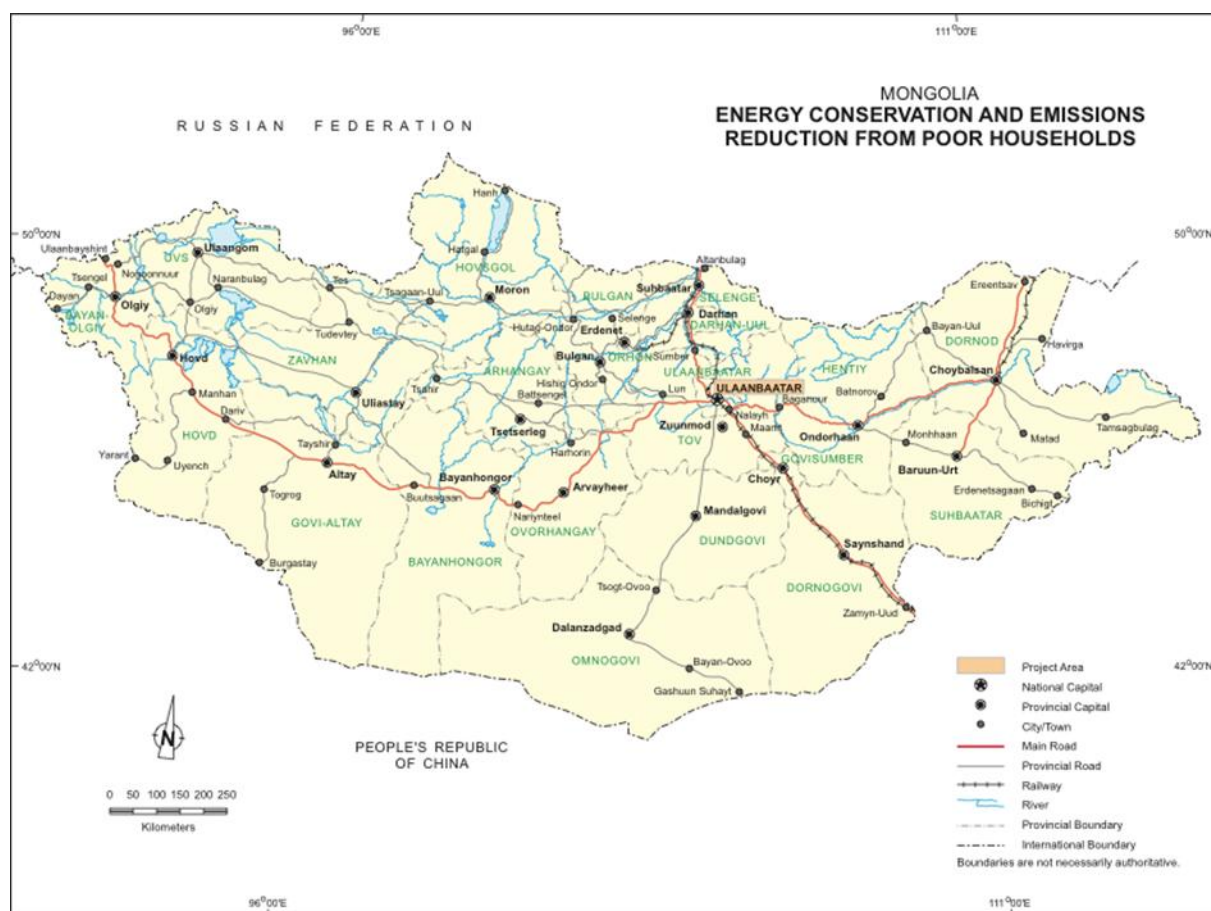
Figure 1: National Map of Mongolia

The host party of the project activity is Mongolia.