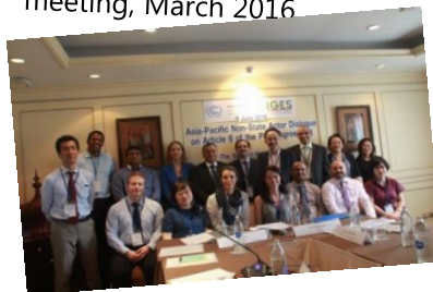
Asia-Pacific non-state actor Article 6 dialogue , June 2016