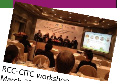
RCC-CITC workshop, March 2017