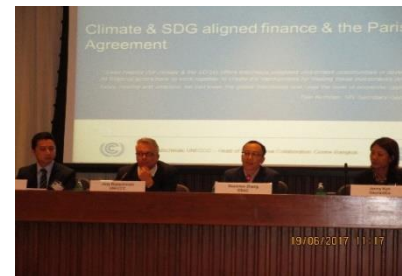
UN ESCAP WG, innovative climate finance, May 2017